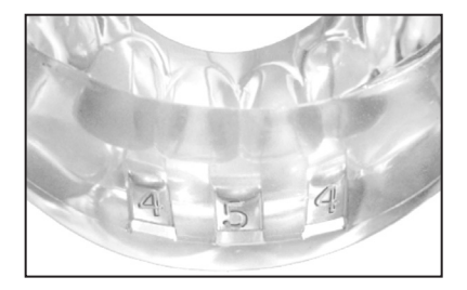
Size, in millimeters (last two digits of part number) molded into each appliance.