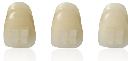
Breakthrough cosmetic design blends your braces so they match your teeth. You'll look great throughout your treatment.