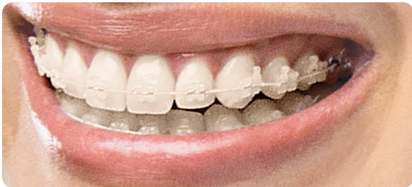
Combined with tooth-colored wire, your braces are almost invisible.

ClearVu Cosmetic Braces are designed not only to correct your teeth efficiently and effectively, but also provide you the most comfortable, visually pleasing braces available. Choosing ClearVu Cosmetic Braces means you will be able to feature your smile, not your braces, throughout your treatment.