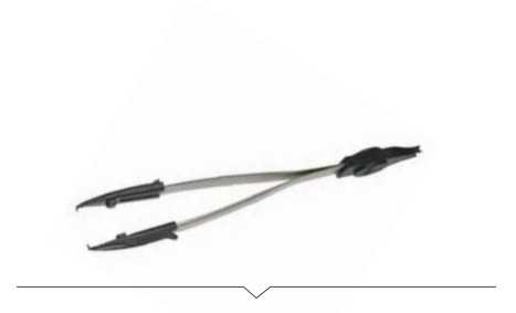
Quick and easy wire changes using forceps designed especially for Click-It.